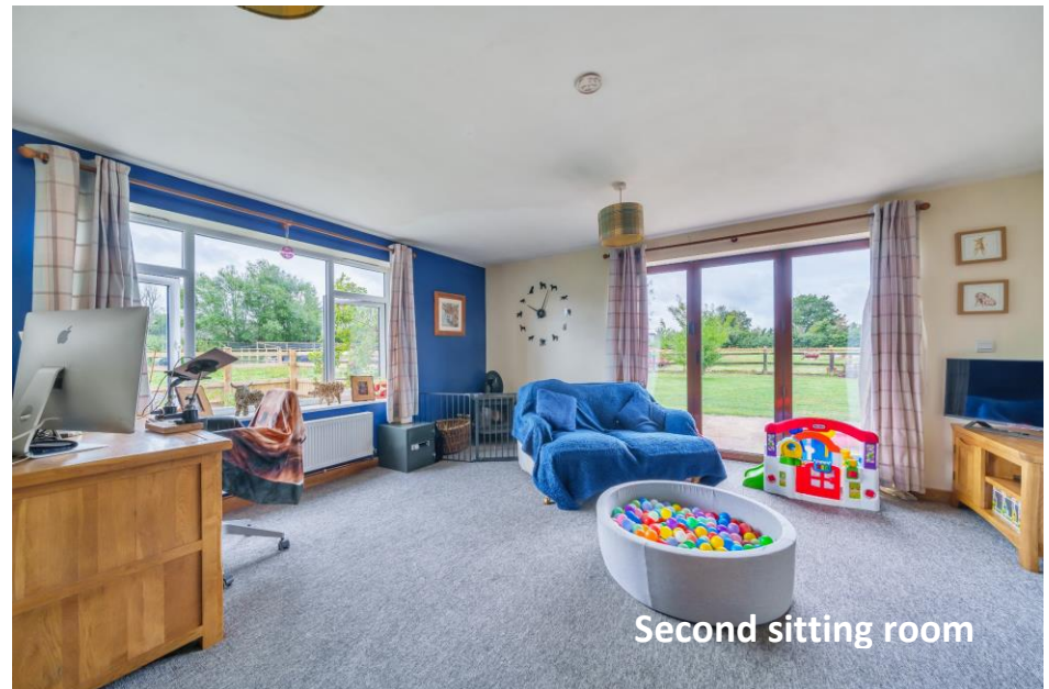
Second sitting room