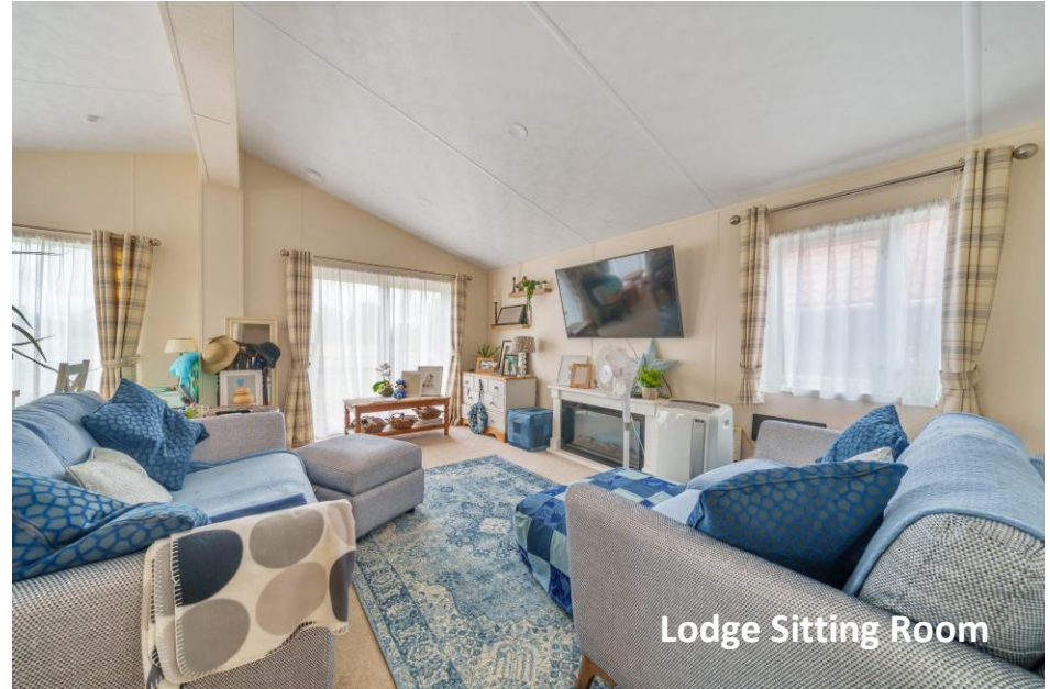
Lodge Sitting Room