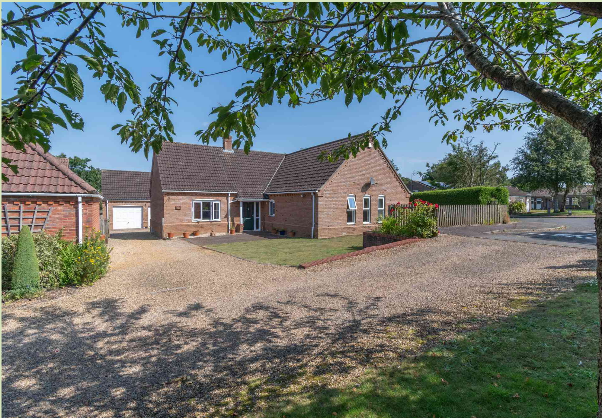
26 Norman Way, Syderstone Guide Price £475,000