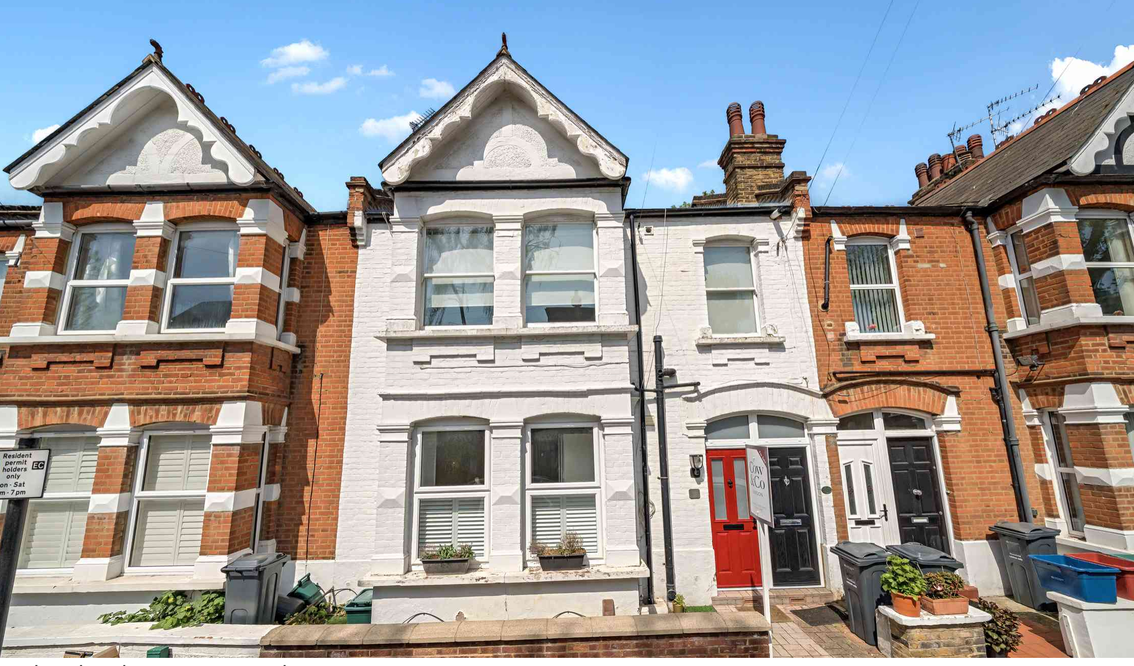
Cleveland Avenue, London, W4 1SW