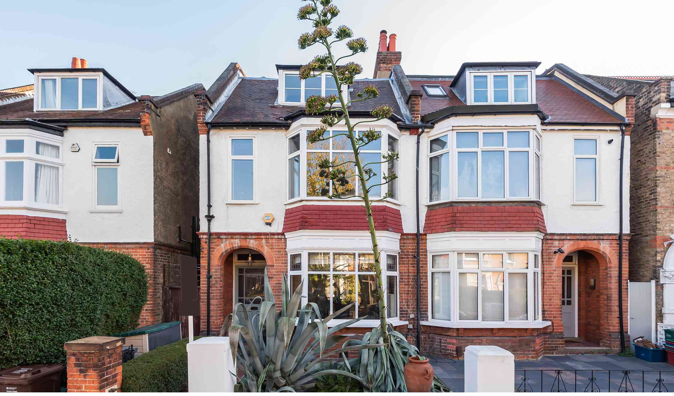
St Marys Grove, London, W4 3LN