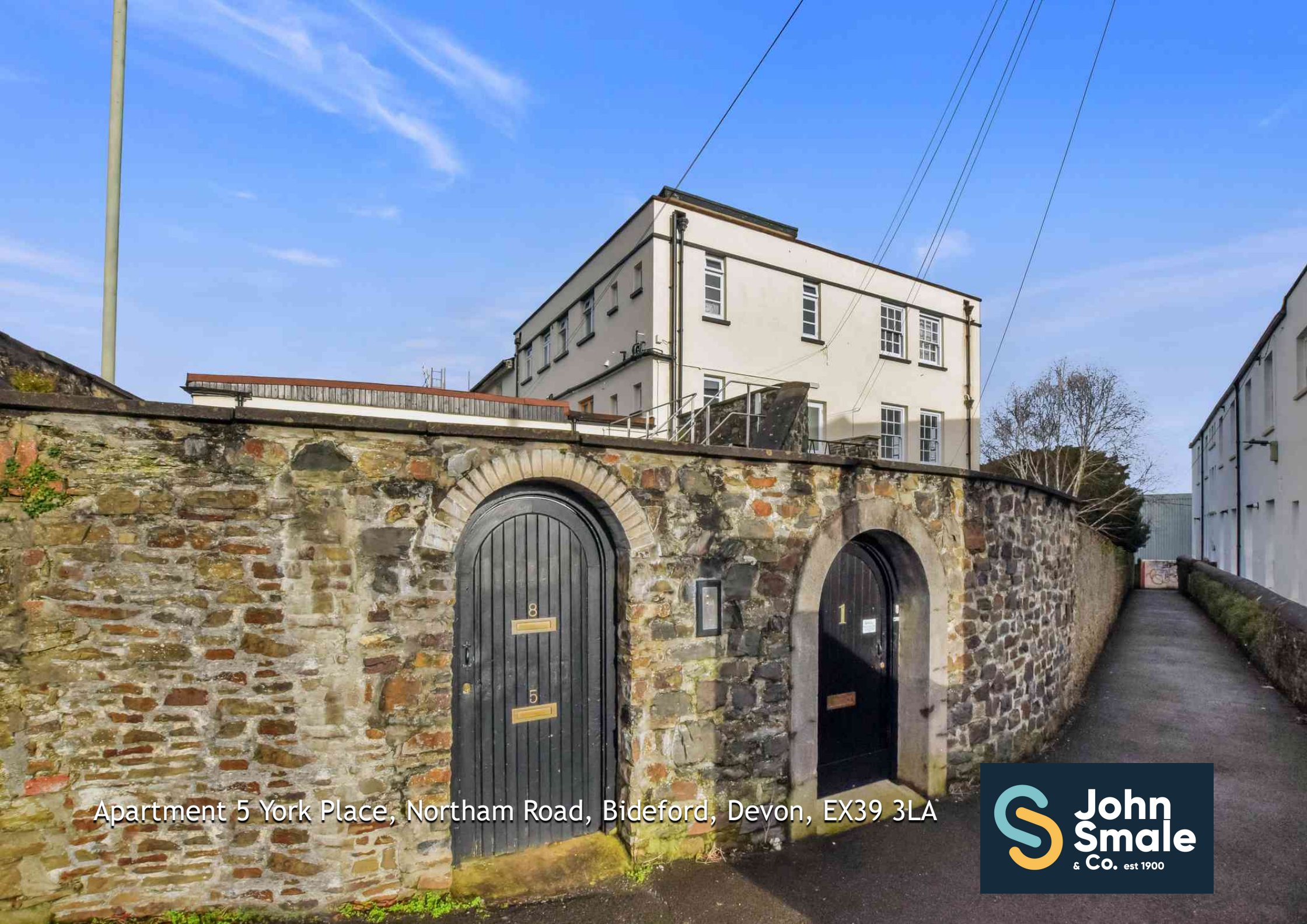
Apartment 5 York Place, Northam Road, Bideford, Devon, EX39 3LA