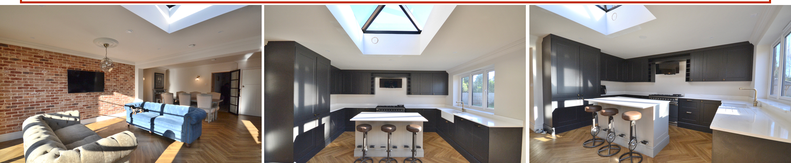
GROUND FLOOR 965 sq ft. (89.3 sq m) approx.