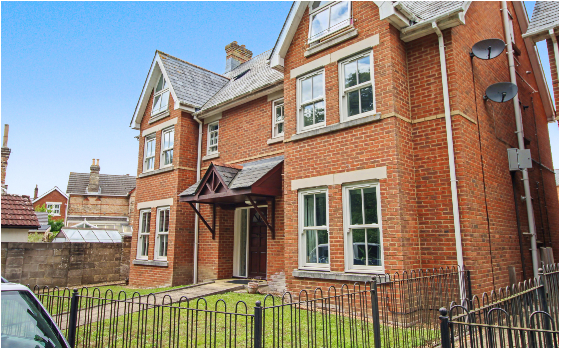
Approach Road, Lower Parkstone, Poole BH14 8BH