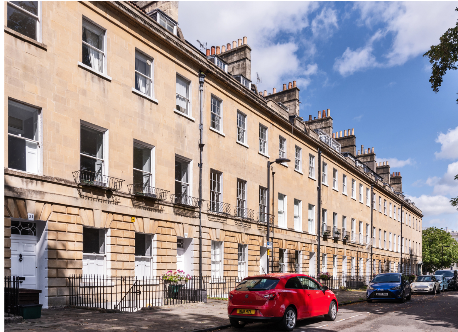
Green Park, Bath