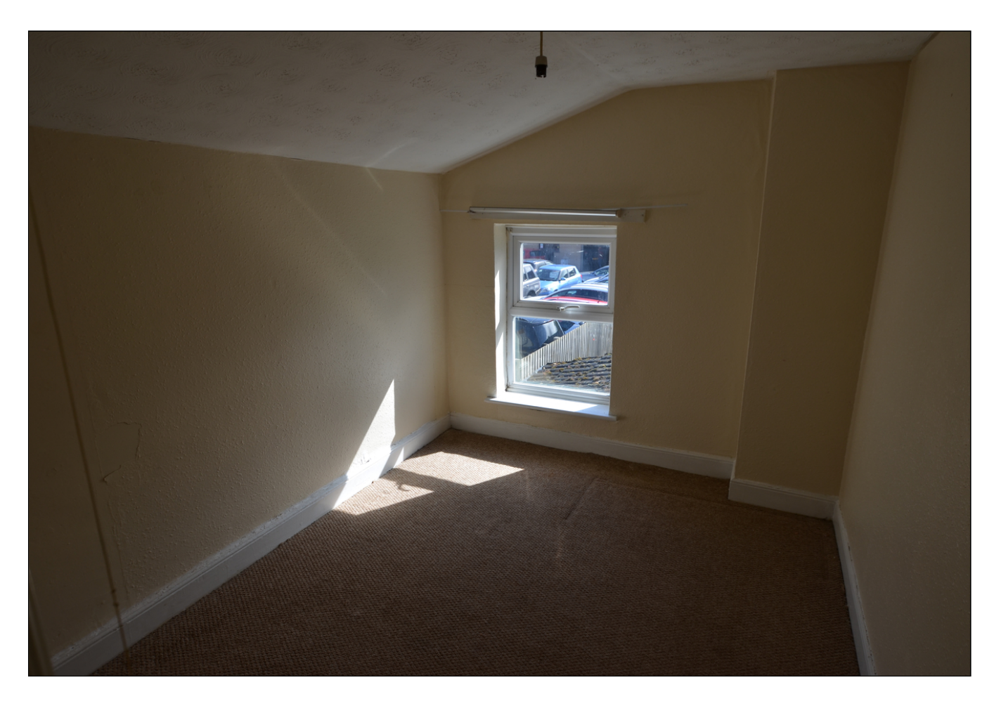
Capitol Lettors has not tested any of the equipment or the heating system (if mentioned) in these details. Purchasers are advised to satisfy themselves as to their working order and condition. These particulars do not constitute or form any part of an offer or contract nor may they be regarded as representations. All interested parties must themselves verify their accuracy. All measurements are approximate.