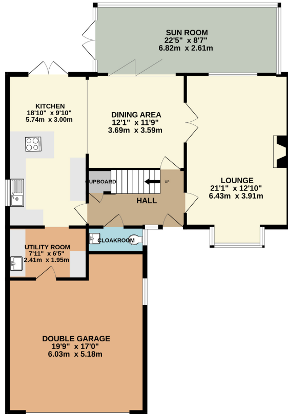
GROUND FLOOR 1249 sq.ft. (116.0 sq.m.) approx.