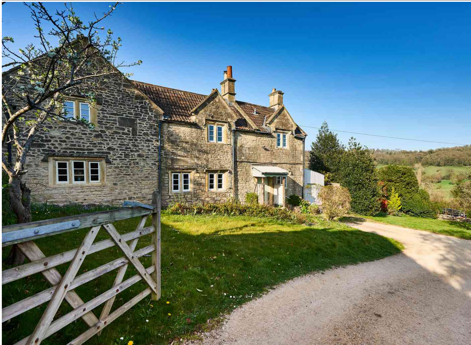
Claverton Village, Nr Bath