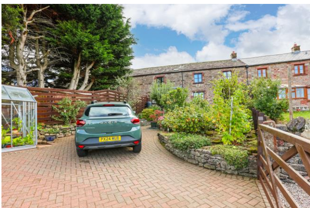
DRIVEWAY PARKING & GARDEN