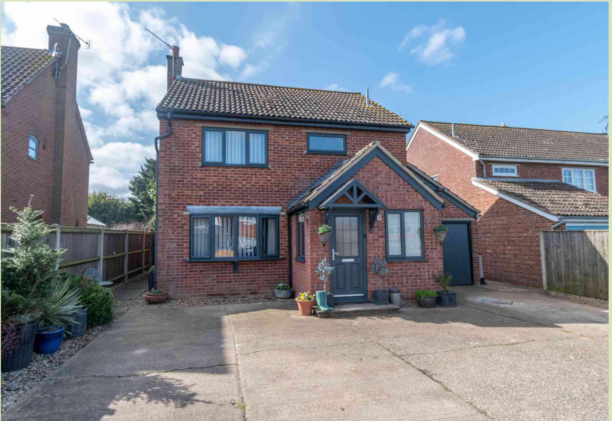
41 Smiths Lane, Fakenham Guide Price £425,000