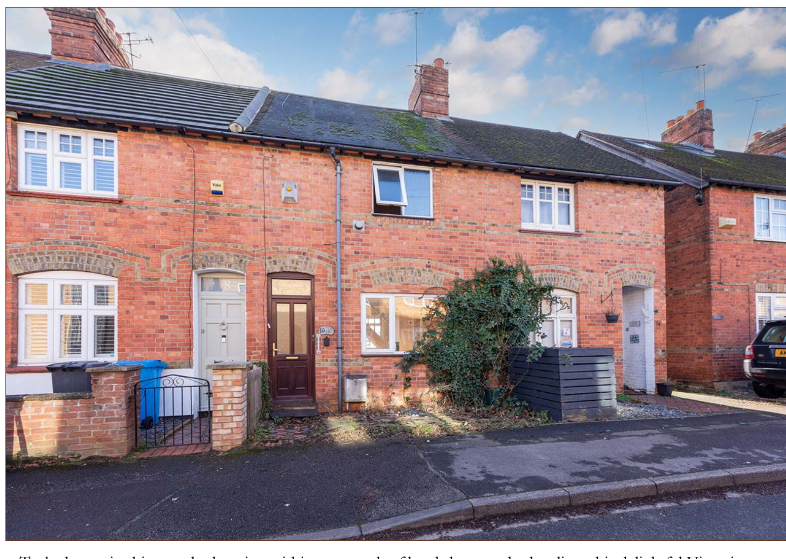
Tucked away in this popular location within easy reach of local shops and schooling, this delightful Victorian two bedroom terraced home comes to the market in need of a full refurbishment

On the ground floor are two reception rooms, a kitchen and bathroom and to the first floor are two double bedrooms both with fitted storage cupboards and one with an en-suite toilet which could be extended into a bathroom. The bonus room in the loft is accessed via stairs from the second bedroom and could easily be converted into a third bedroom