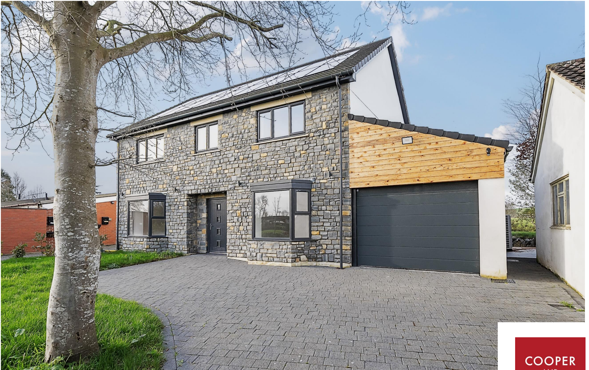
Underdown Cottage, Dark Lane, Coxley, BA5 1RF