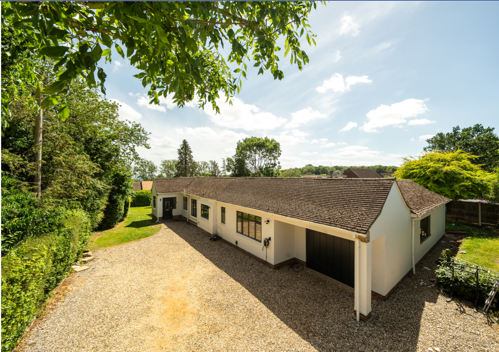
Halls Road, Tilehurst, Reading, Berkshire.