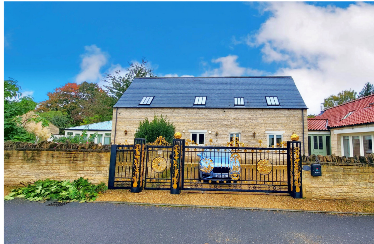
11a Castle End Road, Maxey PE6 9EP