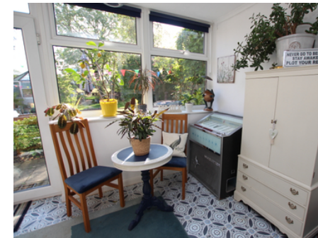
87 Brookbridge Lane, Datchworth, Knebworth, Hertfordshire, SG3 6SZ