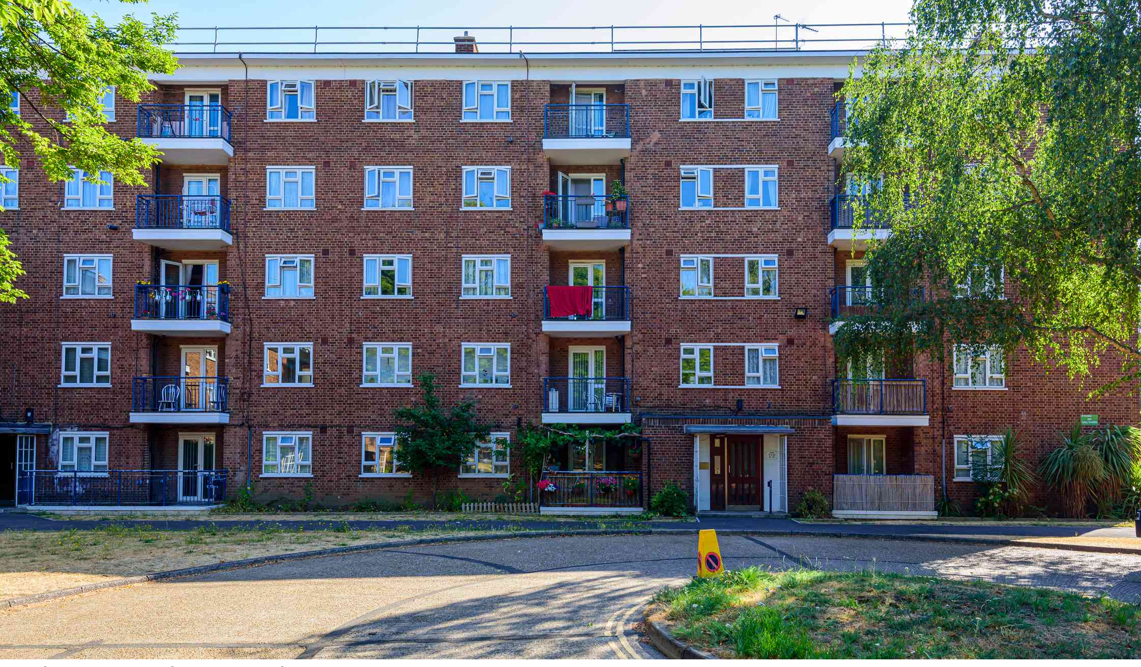
Edensor Gardens, London, W4 2RB