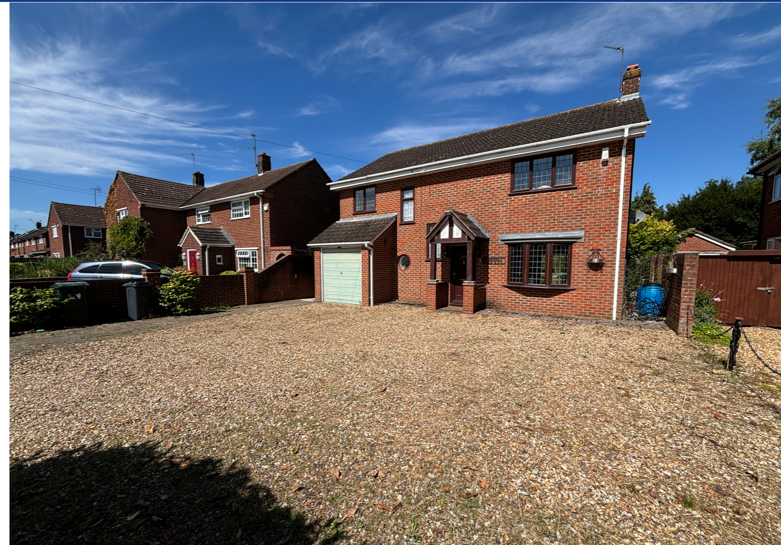
Southcote Lane, Reading, Berkshire. RG30 3AF.