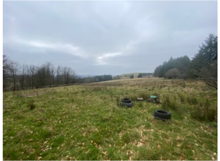
LAND (THIRD IMAGE)