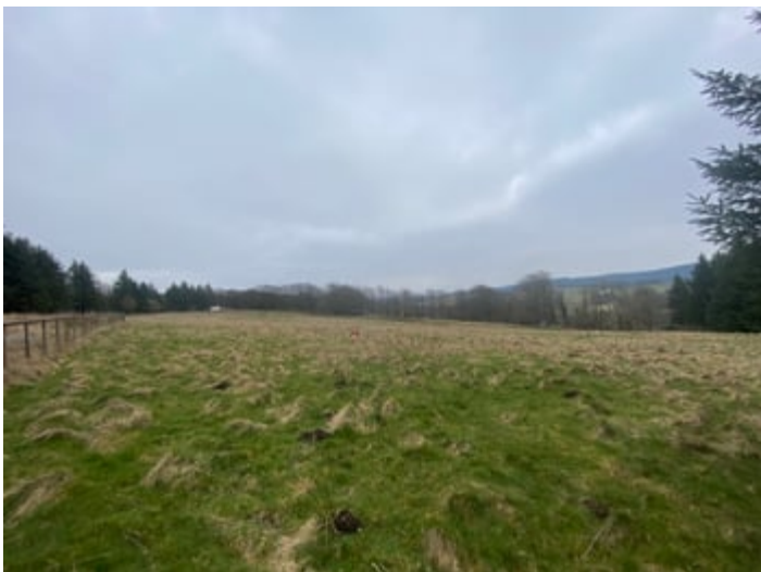
OPEN FIELD BARN (FIRST IMAGE)