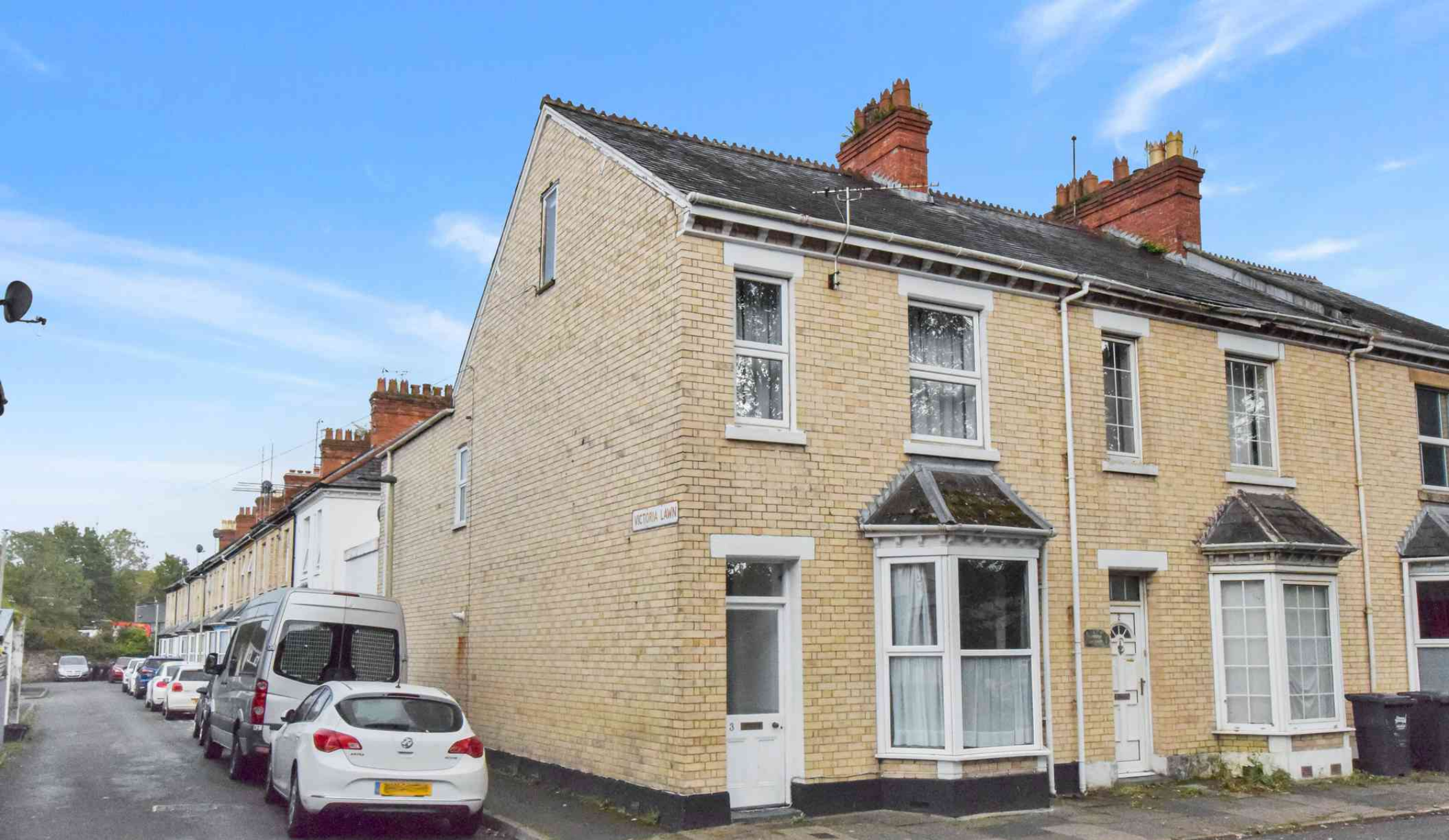
3 Victoria Lawn, Newport, Barnstaple, Devon, EX32 9HU