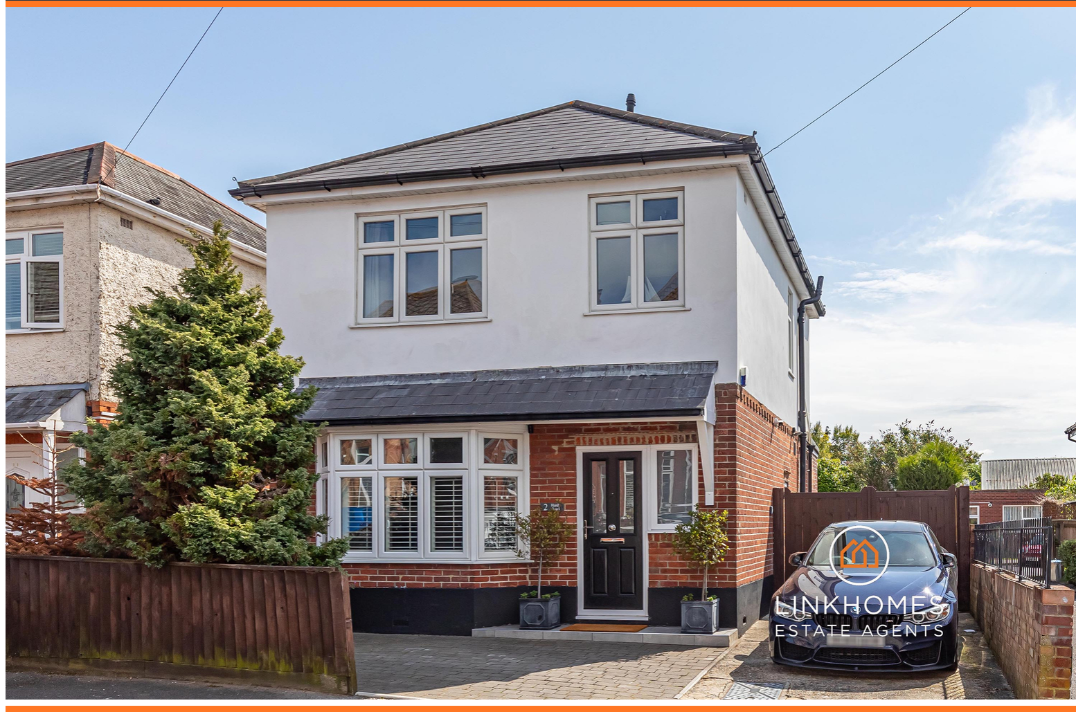
2 Hardy Road, Poole, Dorset, BH14 9HN Offers Over £500,000

** FULLY REFURBISHED THROUGHOUT ** COURTHILL CATCHMENT AREA ** Link Homes Estate Agents are delighted to market for sale this immaculately-presented three bedroom detached house in the much-desired BH14 postcode. Benefitting from an array of standout features including an open-plan shaker-style kitchen/dining room with direct access onto the private rear garden, a separate snug with stunning original features, three good-sized bedrooms with bedrooms one and two offering bespoke fitted wardrobes, a stunning three-piece family bathroom suite, a downstairs cloakroom and a block-paved driveway for two vehicles.