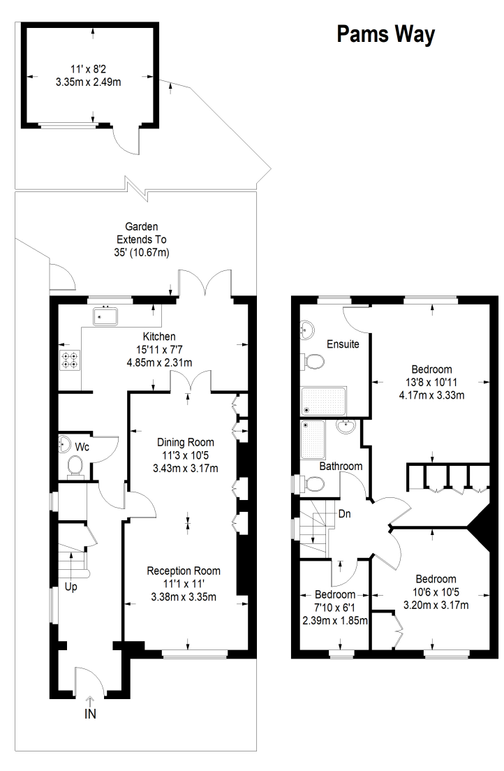
Ground Floor = 518 sq ft