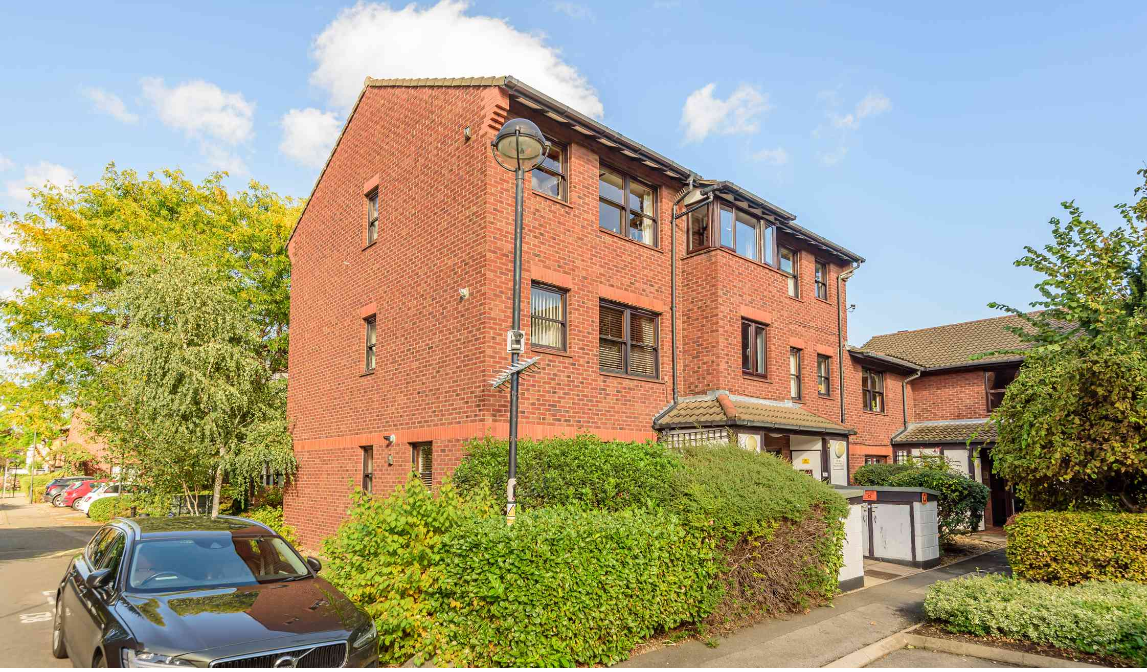
Holley Road, London, W3 7TR