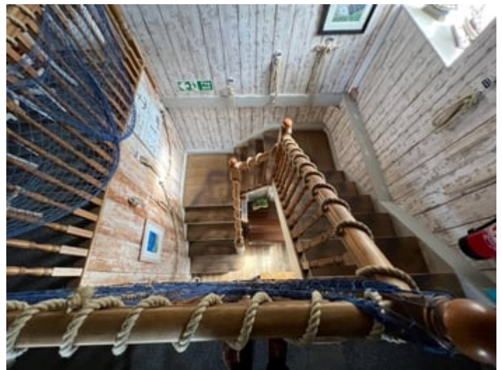
From the Bar a wide dog leg staircase leads to the First Floor which offers