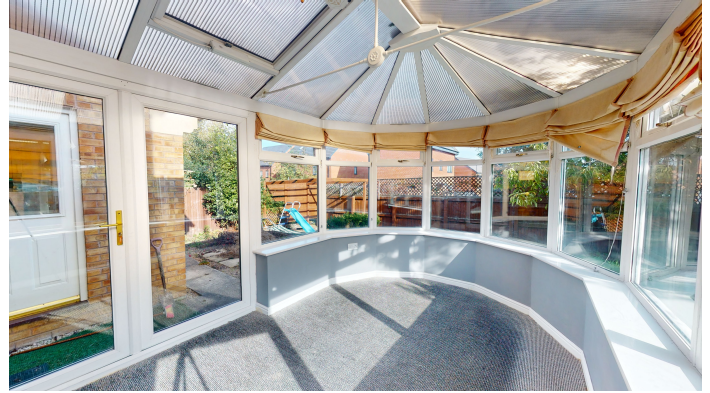
Third Reception Room