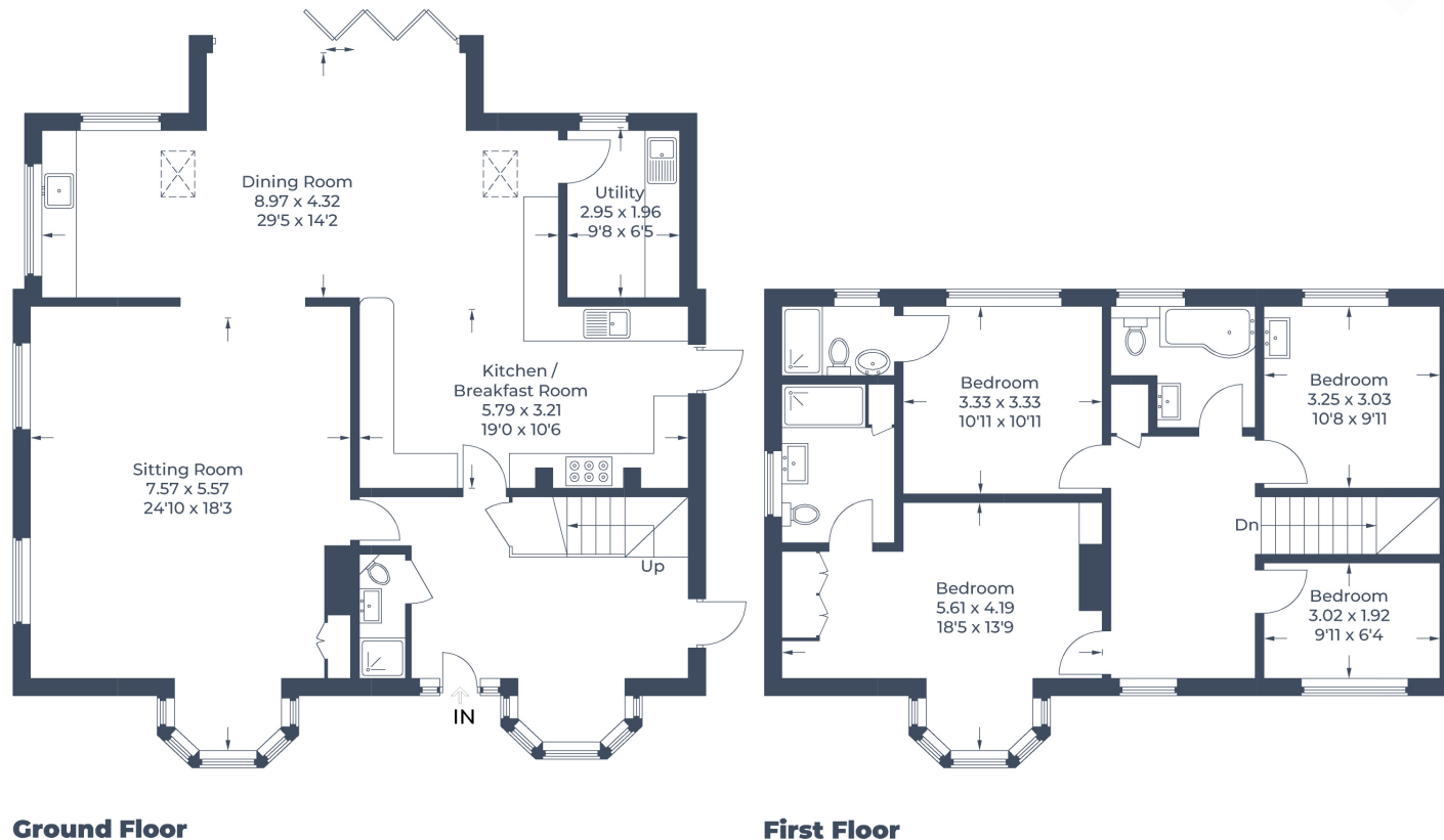
Illustration for identification purposes only, measurements are approximate, not to scale. © CJ Property Marketing Produced for Country Properties

All measurements are approximate and quoted in metric with imperial equivalents and for general guidance only and whilst every attempt has been made to ensure accuracy, they must not be relied on. The fixtures, fittings and appliances referred to have not been tested and therefore no guarantee can be given and that they are in working order. Internal photographs are reproduced for general information and it must not be inferred that any item shown is included with the property. For a free valuation, contact the numbers listed on the brochure.