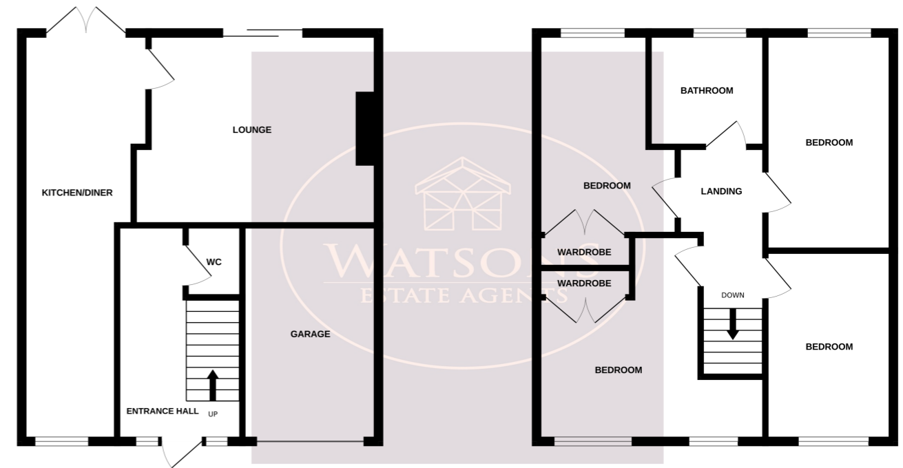
TOTAL FLOOR AREA : 1122 sq.ft. (104.2 sq.m.) approx.

Whilst every attempt has been made to ensure the accuracy of the floorplan contained here, measurements of doors, windows, rooms and any other items are approximate and no responsibility is taken for any error, omission or mis-statement. This plan is for illustrative purposes only and should be used as such by any prospective purchaser. The services, systems and appliances shown have not been tested and no guarantee as to their operability or efficiency can be given. Made with Metropix ©2023