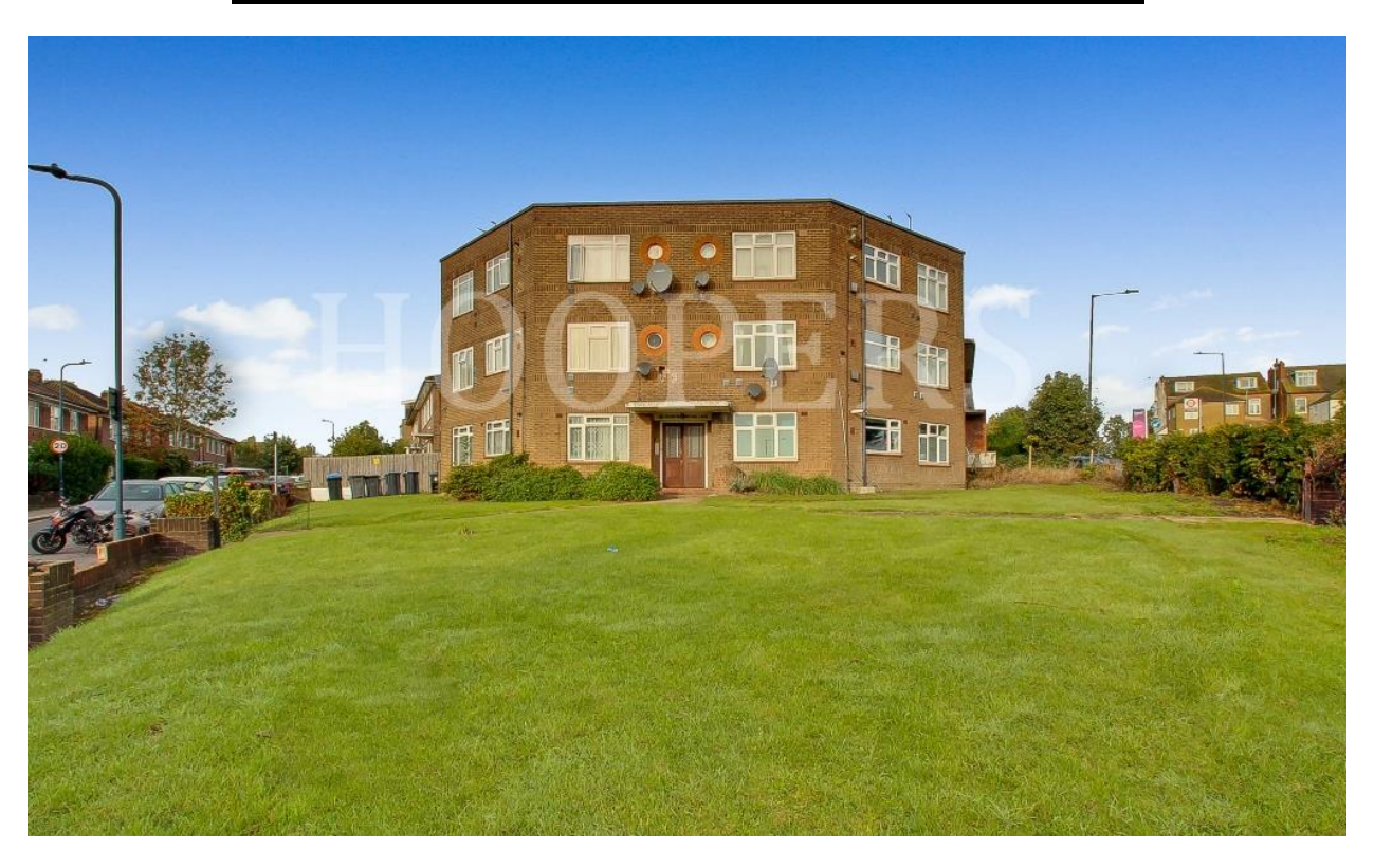
EPC Rating: D

We are delighted to be instructed to offer for sale this spacious first floor flat in a purpose built development constructed circa 1938 and offering spacious accommodation for a first time buyer or this property would make an excellent buy-to-let investment due to its size and close proximity to Neasden (Jubilee Line) Tube Station. Benefits include:-