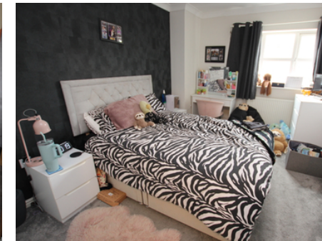
1 The Railway, Henlow, Bedfordshire, SG16 6FN