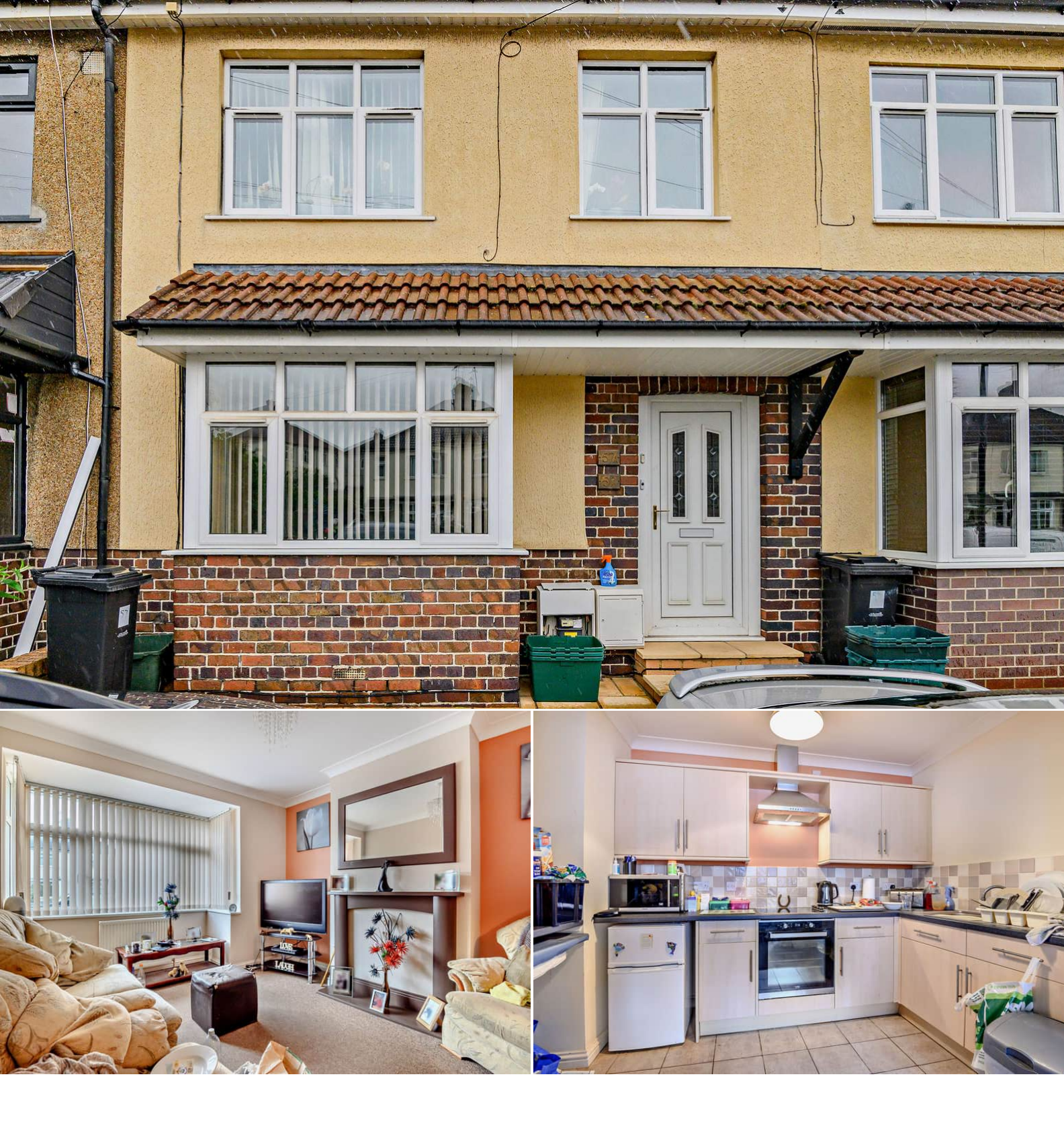
Offers in Excess of £189,000