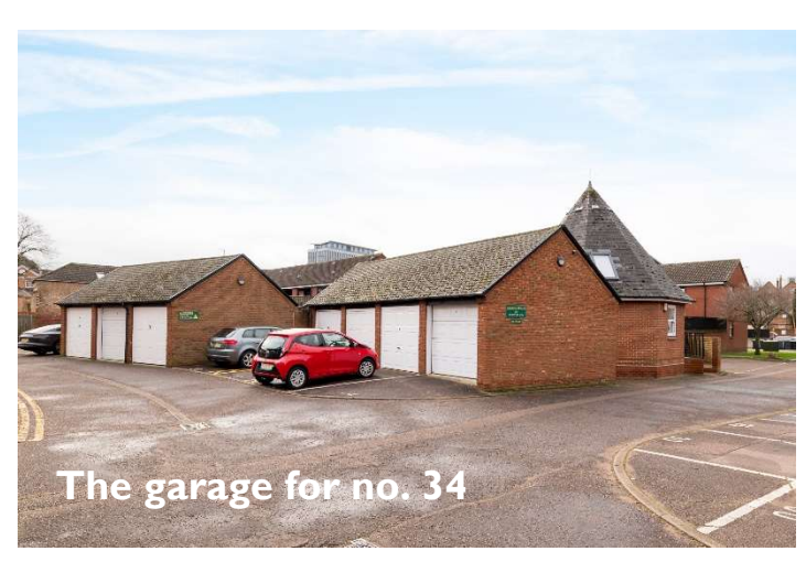
34 Duckmill Crescent Duckmill Lane, Bedford, MK42 0AF