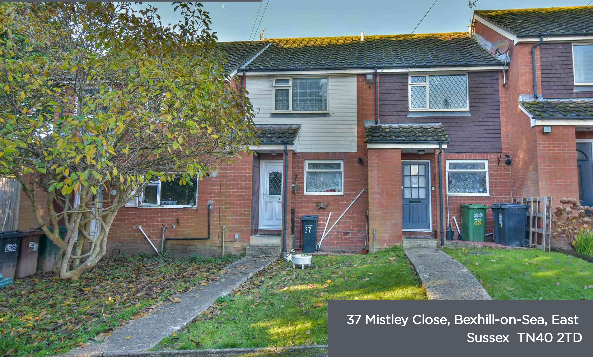
37 Mistley Close, Bexhill-on-Sea, East Sussex TN40 2TD