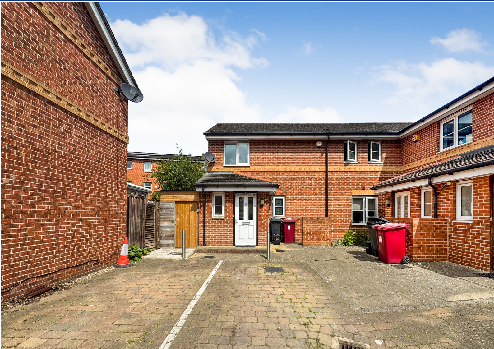
Battle Place, Reading, Berkshire. RG30.