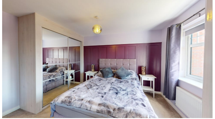
Master Bedroom With En Suite