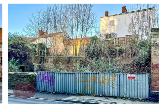
Our Seller says....