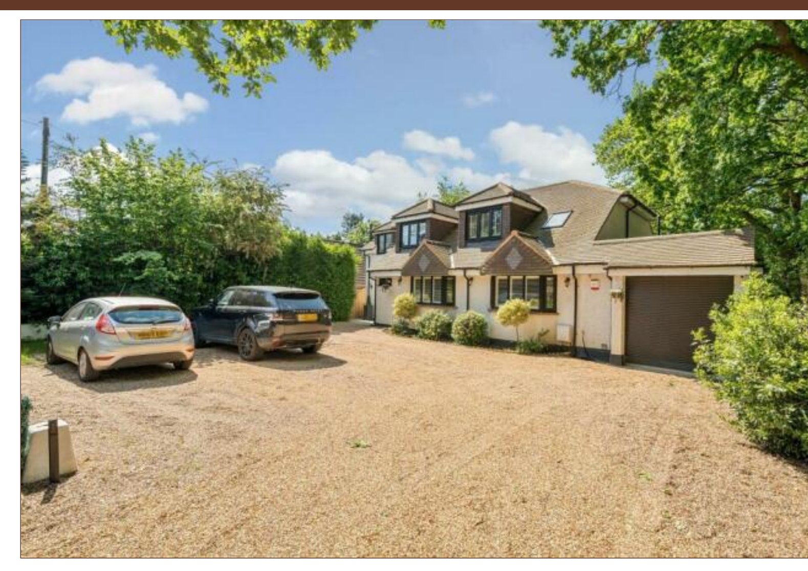
Superbly designed and renovated by the current owners this FOUR double bedroom detached family home comes to the market in stunning turn key condition. Located in an ideal setting, close to all the major access routes of Maidenhead this stunning property offers ample and versatile living and entertaining space over two floors

To the ground floor, the elegant hallway leads to a stylish and well appointed kitchen/diner with bi fold doors providing access to the patio and garden. Within the kitchen, there is a central island, an array of floor to ceiling cupboards and space for large formal dining table. Behind the kitchen is a very useful utility room leading to the garage which has been converted into a gym/storage space. The main reception room is highlighted by a feature fireplace and enjoys views out onto the garden, there is also a spacious bedroom with fully fitted en suite bathroom, a further reception room and a wc.