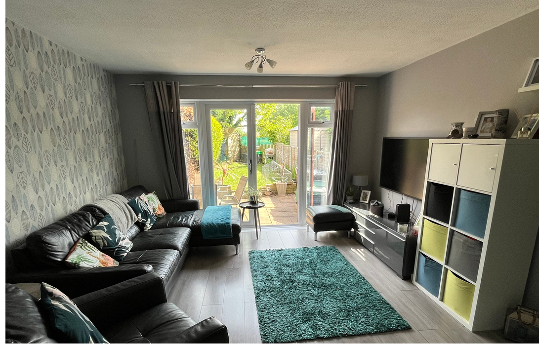
53 Deerhurst Close, Feltham, Greater London TW13 7HS £425,000 - Freehold