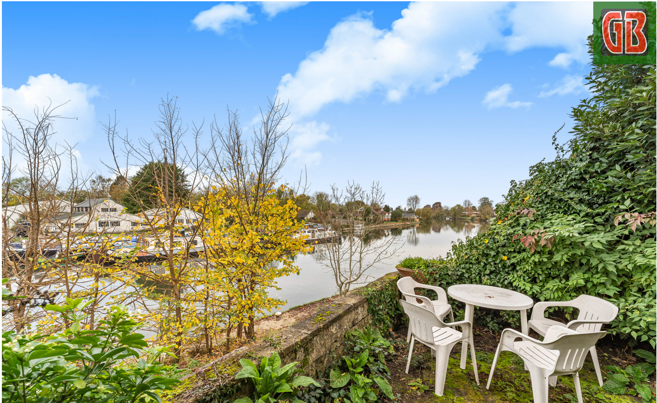
3 Virginia Close, Laleham, Staines-Upon-Thames. TW18 1UD. 3 Bedroom End of Terrace House - £550,000 Freehold