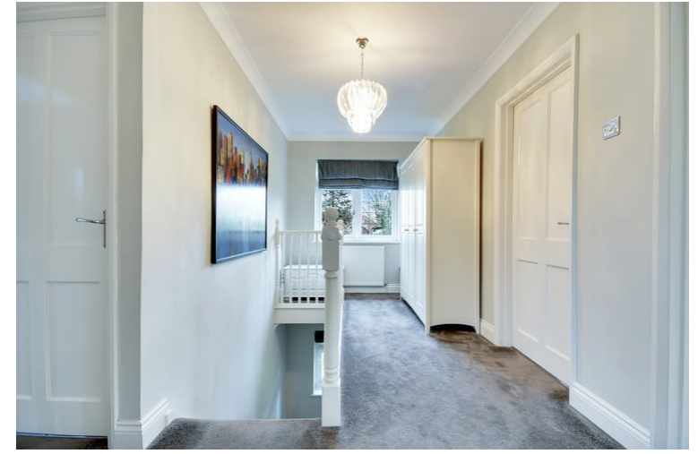
4.30m x 3.28m (14' 1" x 10' 9") The landing draws light from a window to the front elevation with radiator below,

access to loft storage and an airing cupboard.