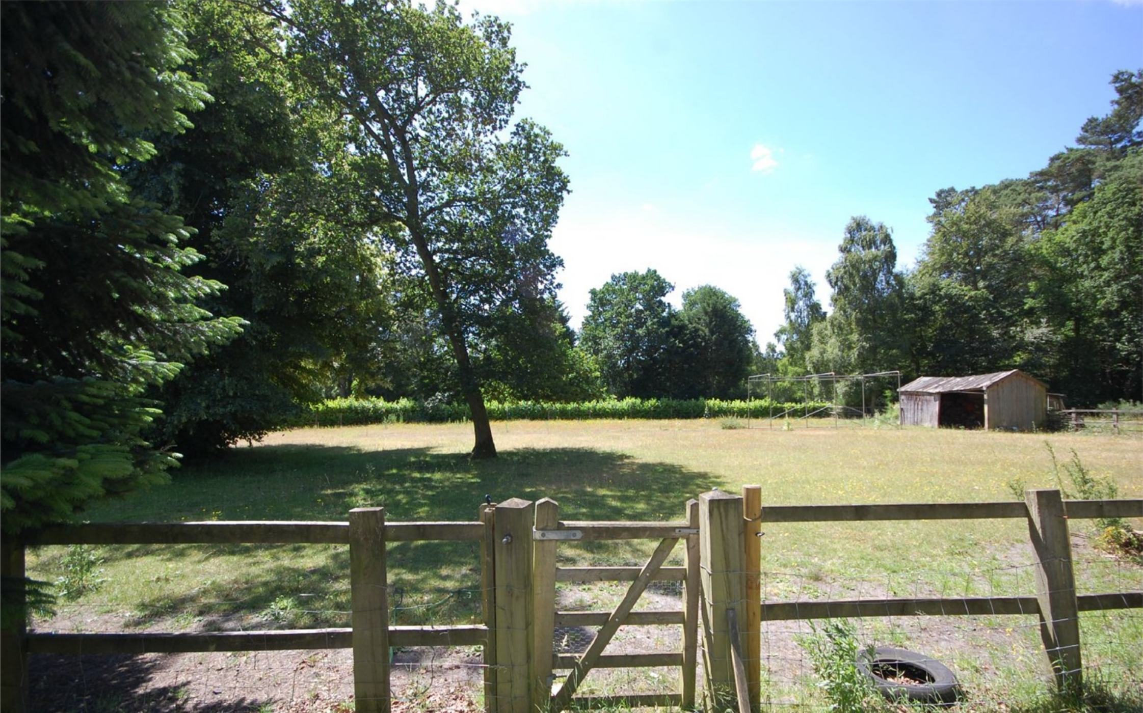
The Firs, Eglinton Road, Rushmoor, Tilford, Farnham, Surrey. GU10 2DH. Guide Price £1,450,000