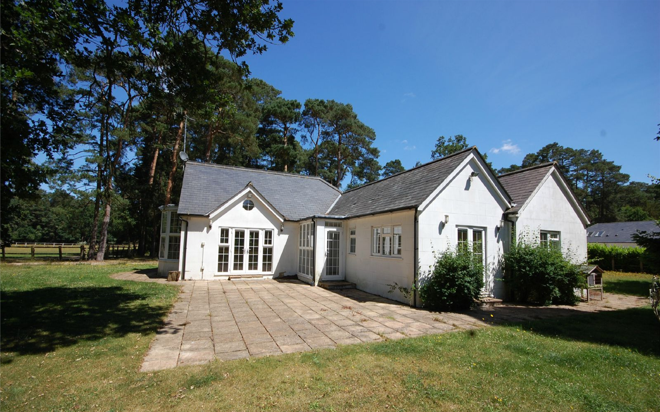
The Firs, Eglinton Road, Rushmoor, Tilford, Farnham, Surrey. GU10 2DH. OIEO £1,500,000