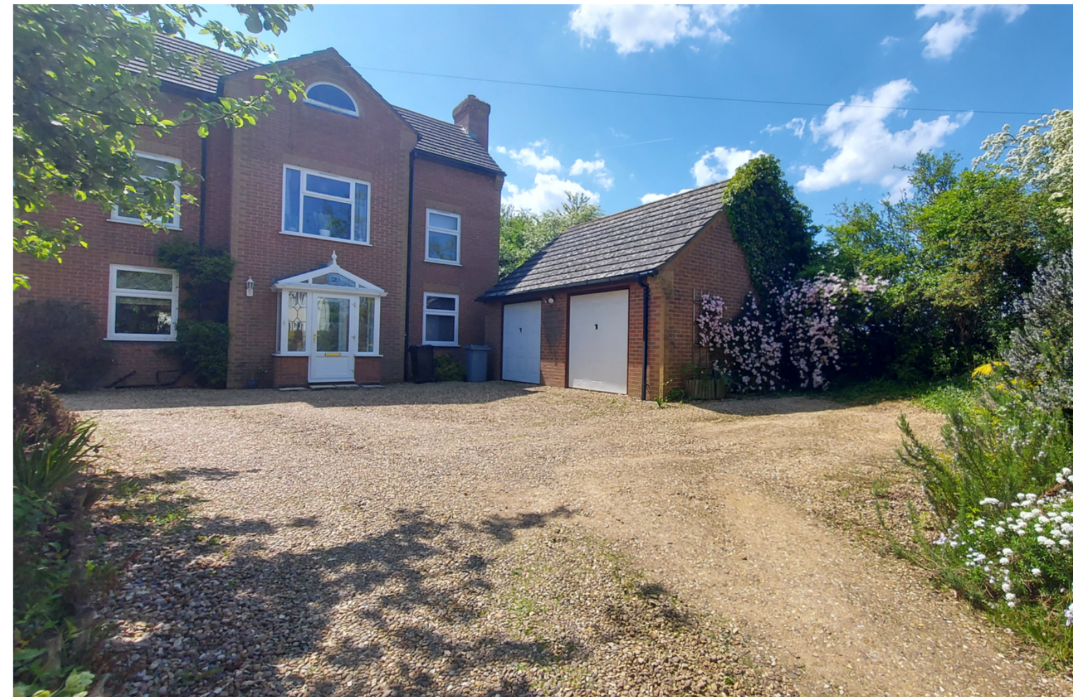
2 Millthorpe Drive, Millthorpe, Sleaford, Lincolnshire NG34 0LD £425,000