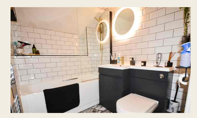
LEASE TERMS We understand the lease for the apartment is 99 years which commenced 1 February 2001.