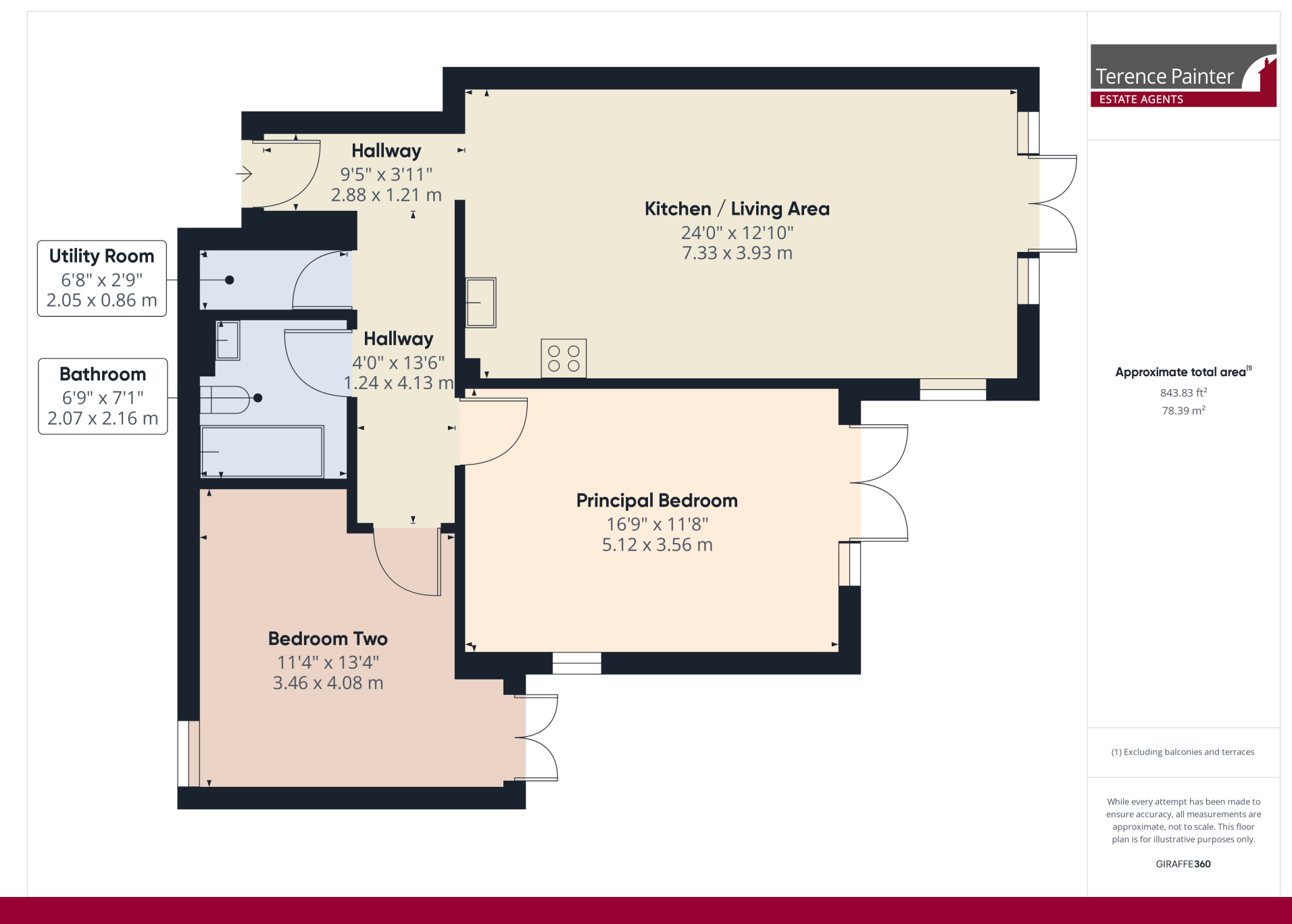
Flat 1, 91 Kingsgate Avenue, Broadstairs, Kent. CT10 3LW.