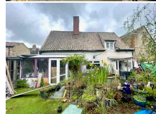
Castle Hill Lane, Huntingdon PE29 3TL