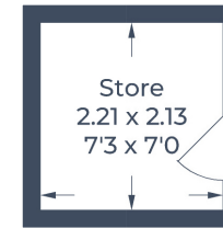
(Not Shown In Actual Location / Orientation)

Illustration for identification purposes only, measurements are approximate, not to scale. © CJ Property Marketing Produced for Country Properties