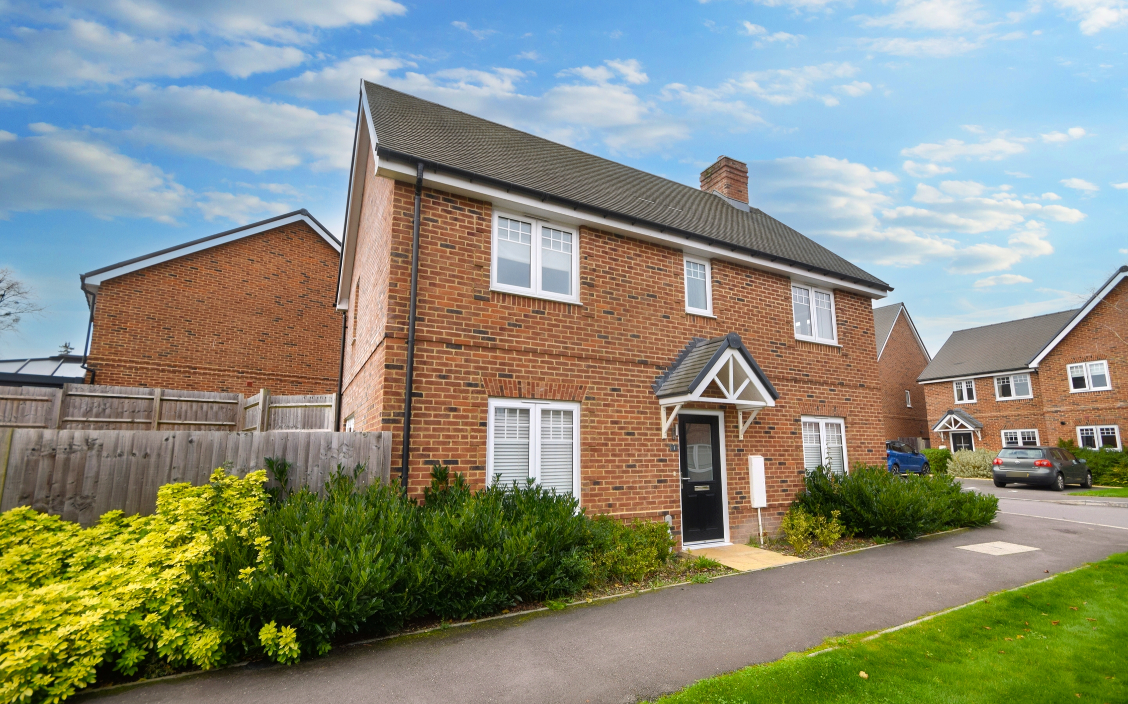
1 Keepsake Close, Farnham, Surrey. GU9 7GS. Guide Price £725,000