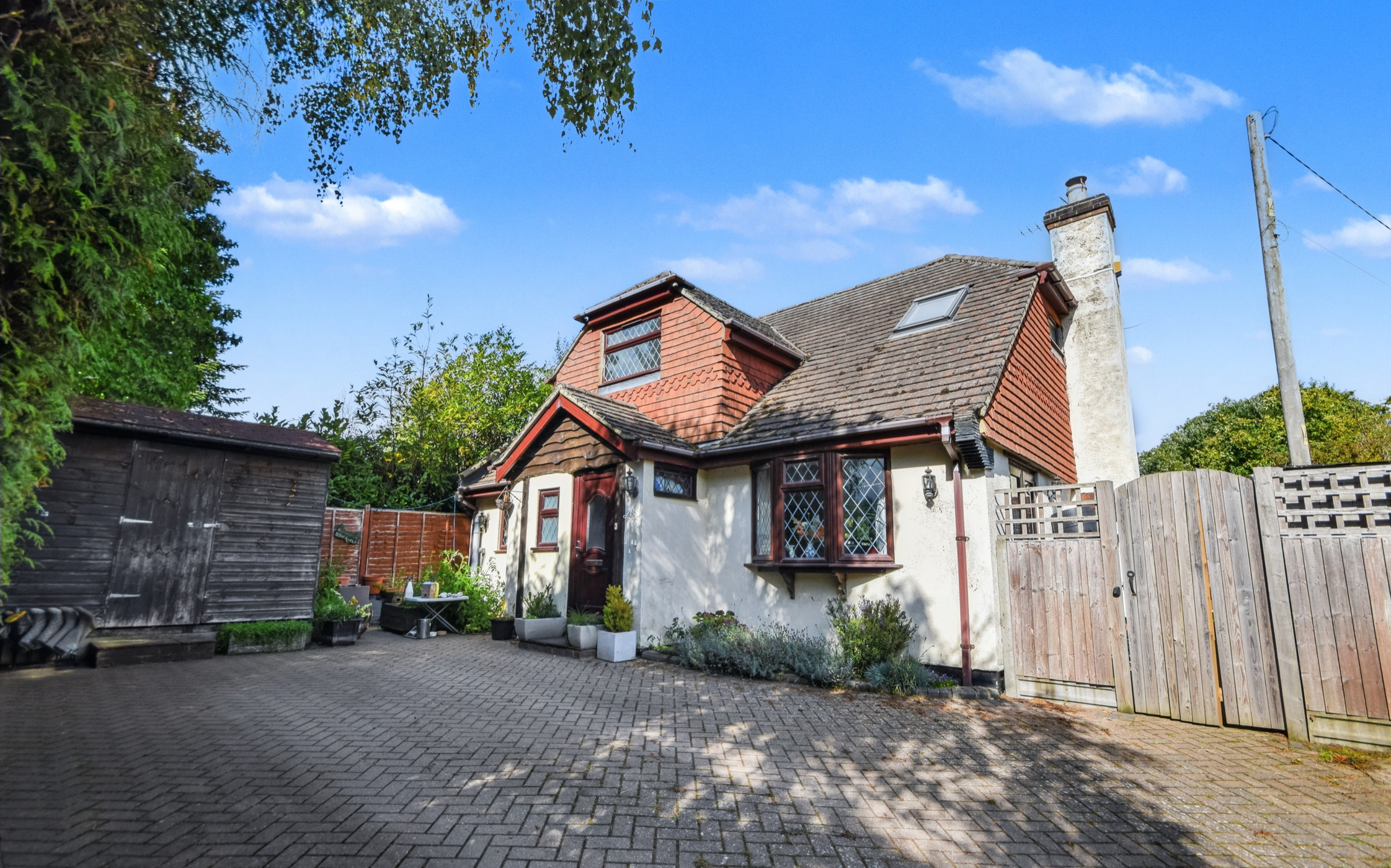
Wayfarers, Fullers Road, Rowledge, Farnham, Hampshire. GU10 4LB. Guide Price £750,000